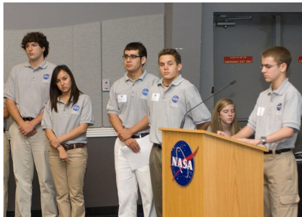
Students Presenting Their Projects