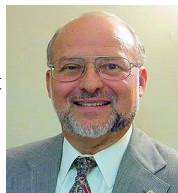
Rotary International President 2008-2009