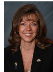
Rotary District 5890 Governor 2008-2009