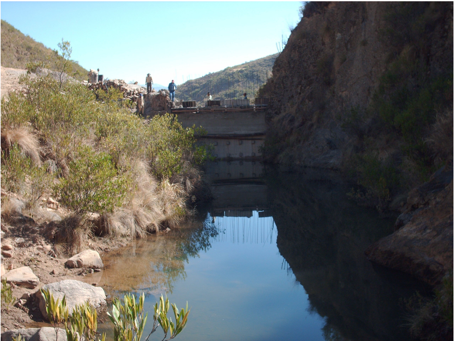
The Rotary Amistad Dam Project in Bolivia