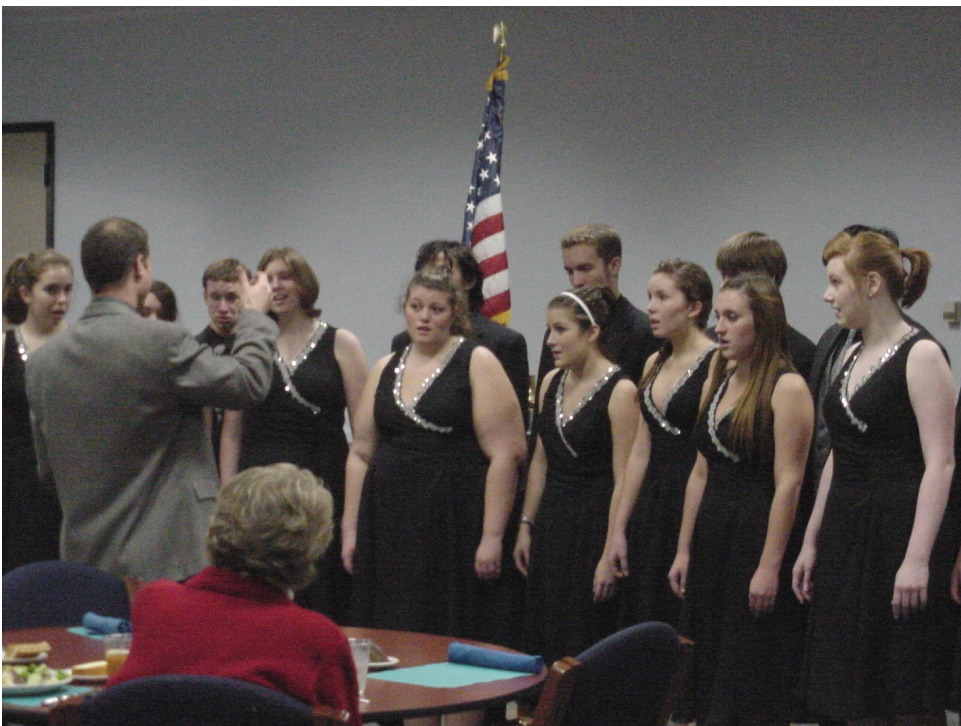
Pics from the 12/08/08 Meeting: Left: The Choir entertains. Right: The two Bills in the chow line.