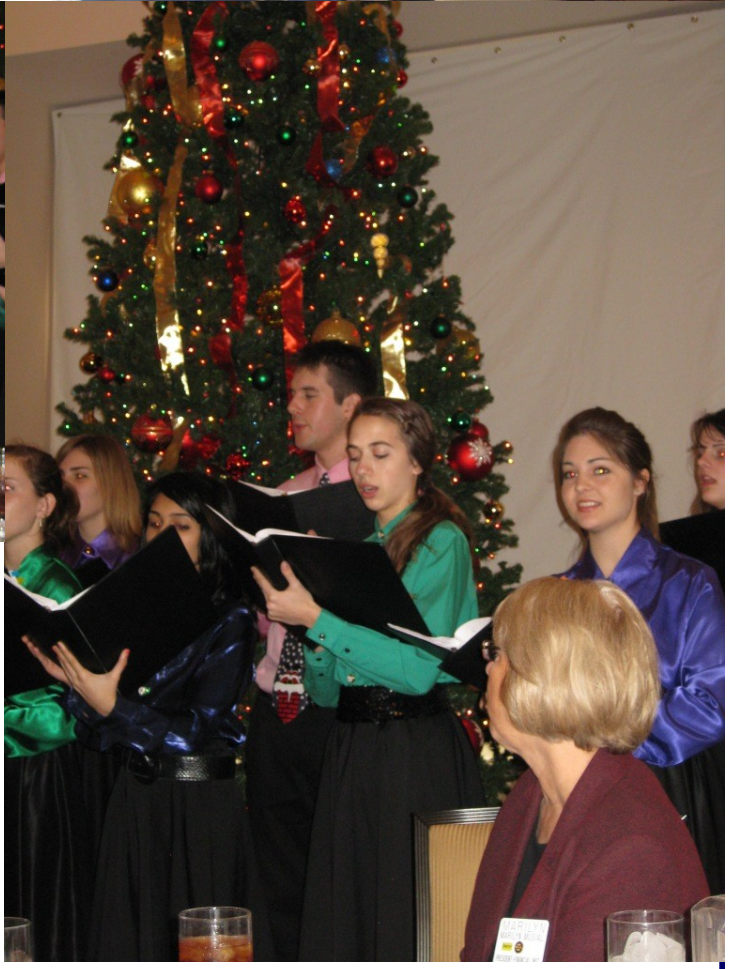
Pics from the December 15th meeting.