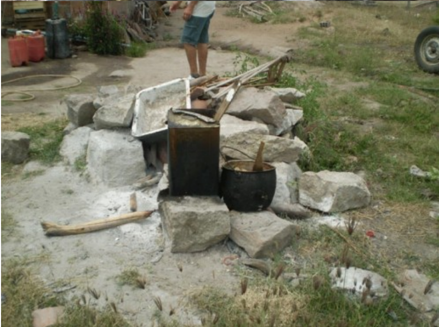
A typical open fire used for cooking