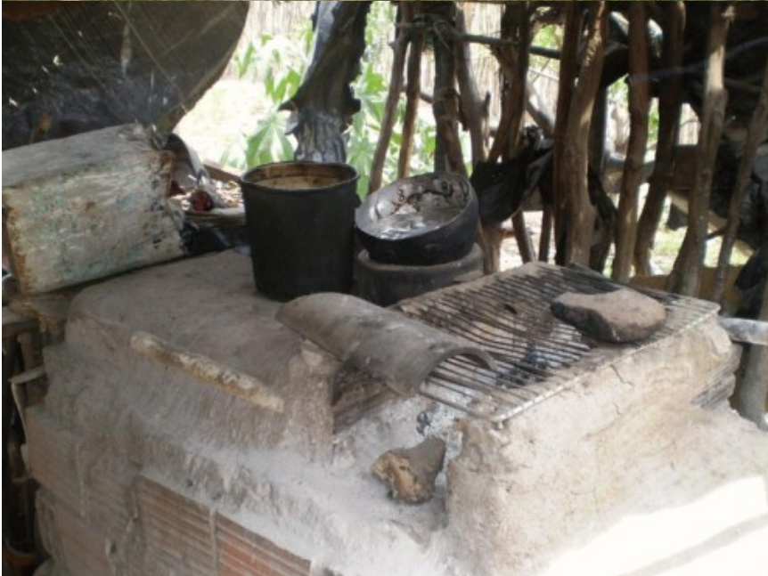
A typical rudimentary indoor cooking stove