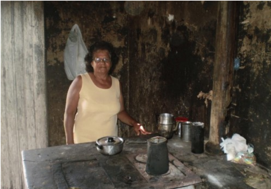
Eco-Stove Pictures ( this page, top to bottom ):