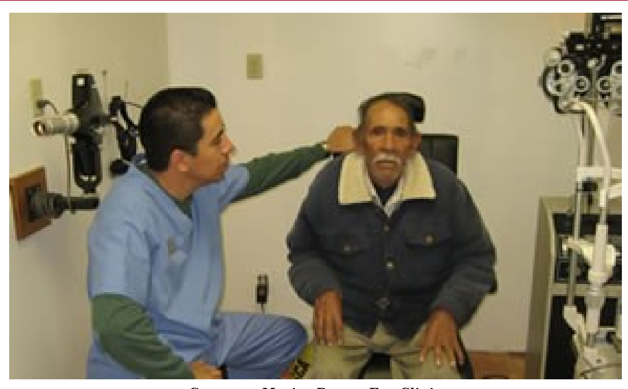
Guerrero, Mexico Rotary Eye Clinic