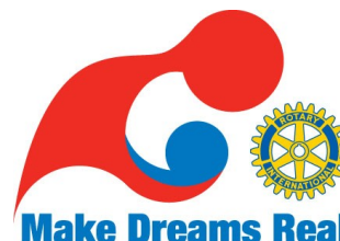
Rotary International President 2008-2009