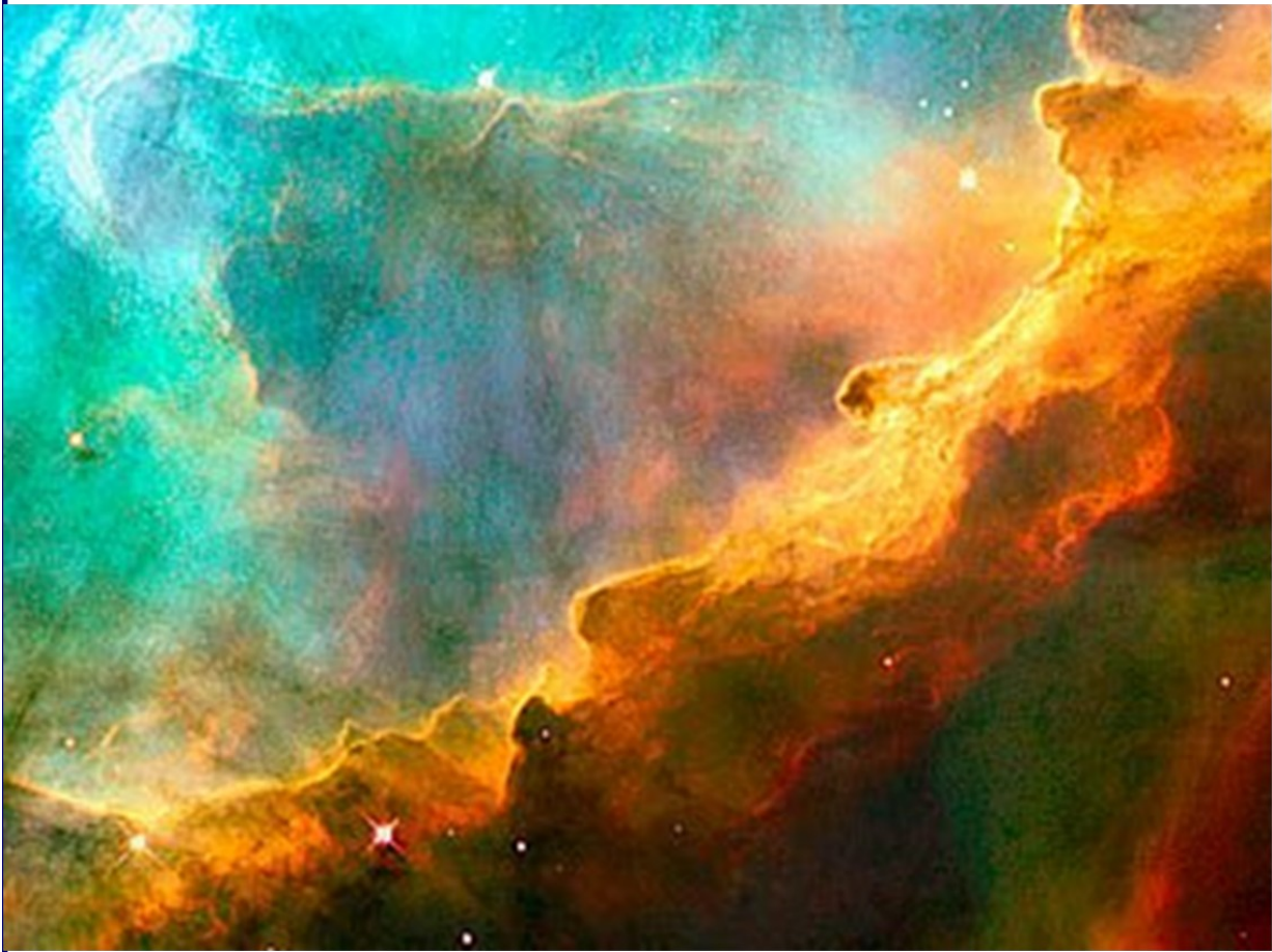
A fragment of the Swan Nebula, located at 5,500 light years away, described as “a bubbling ocean of hydrogen with small amounts of oxygen, sulfur and other elements”.