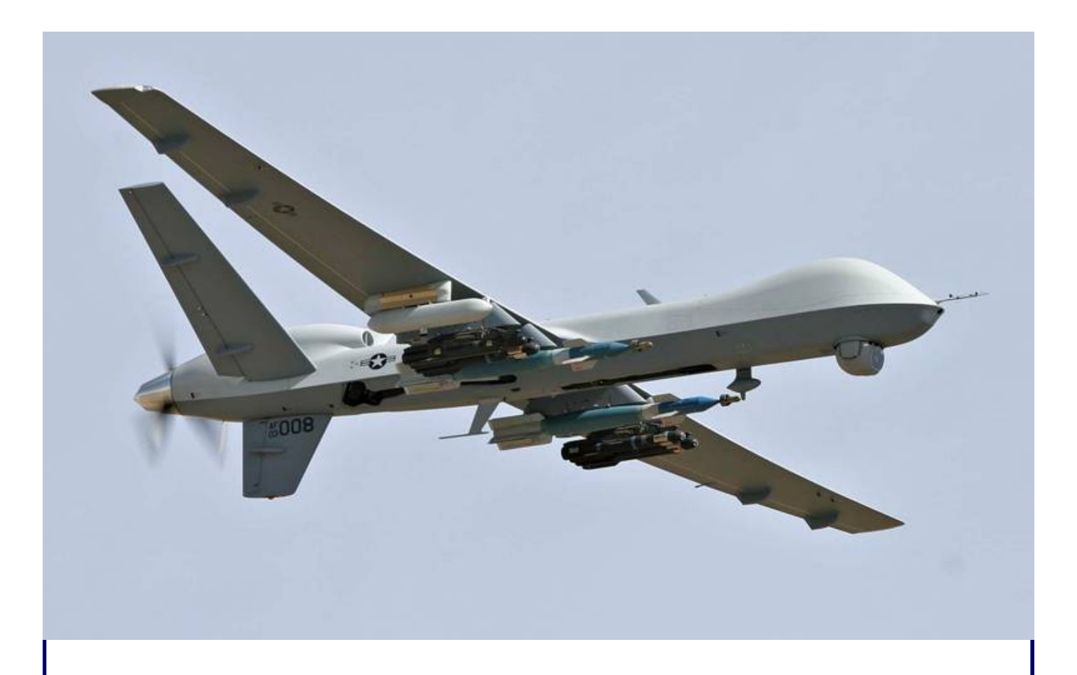
Bomb-laden 'Reaper' drones bound for Iraq and Afghanistan