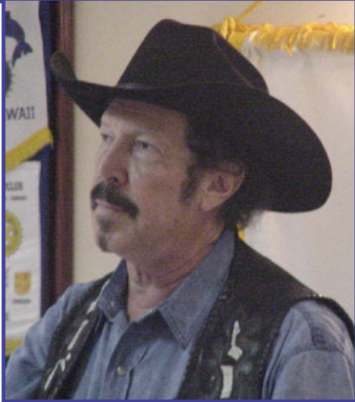
Kinky Friedman, candidate for Texas governor