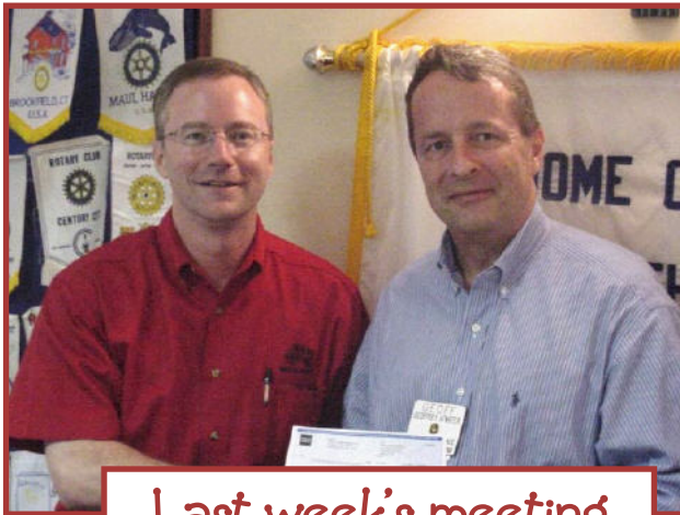
Last week's meeting