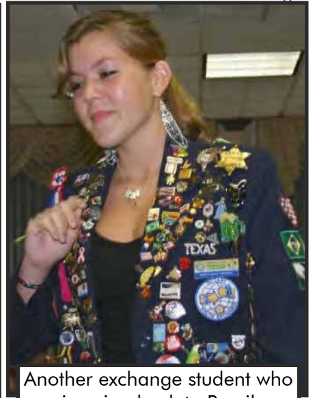
Another exchange student who is going back to Brazil