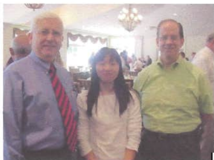
Rotary Ambassadorial Scholar