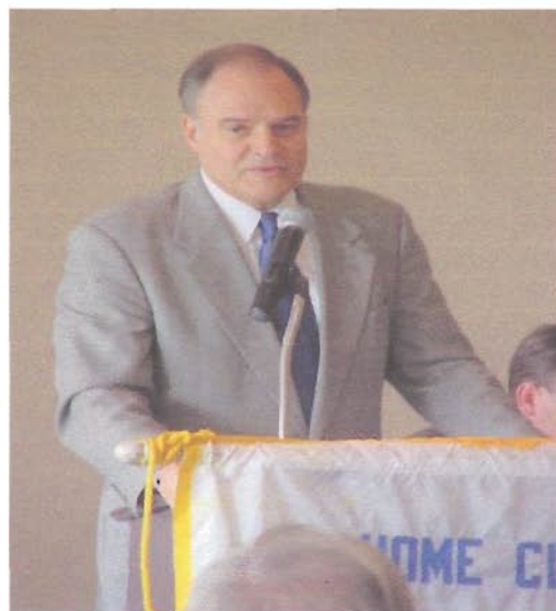
Monday's program, former U S Congressman, Nick Lampson, candidate.