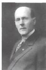
Paul Harris (1868-1947) Founder of Rotary