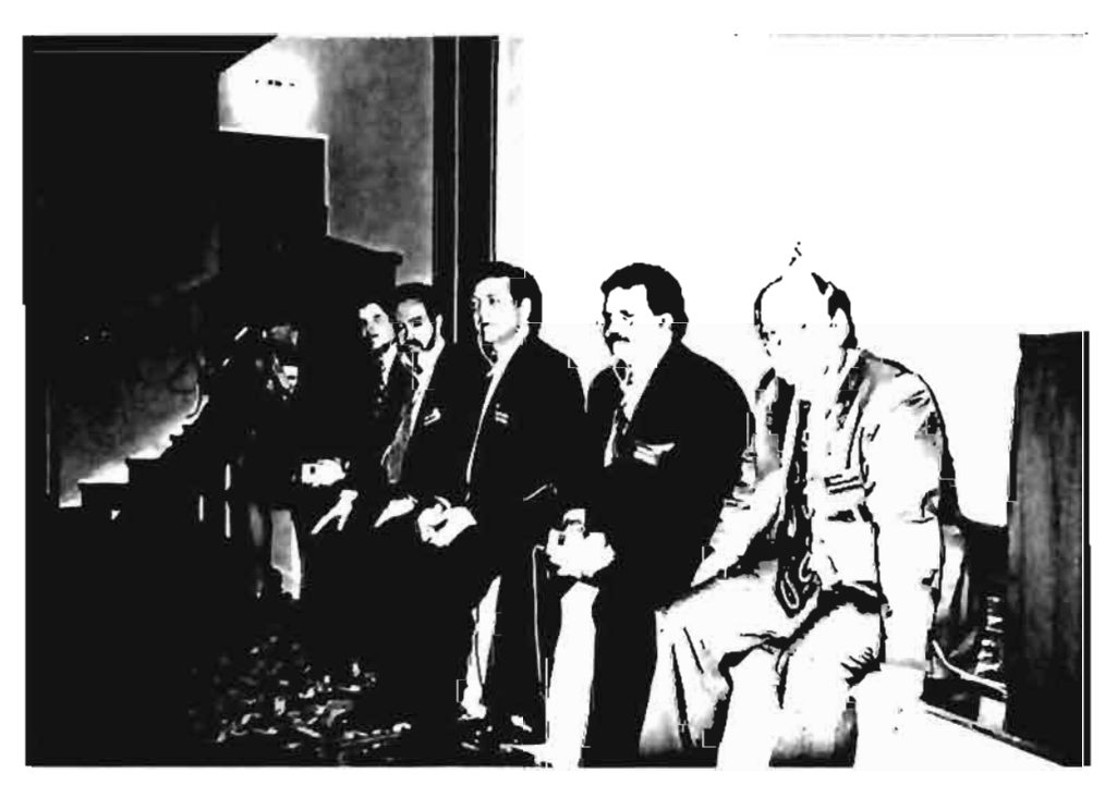
After presenting a day of lectures on the principles of Free Enterprise, management, marketing, accounting, finance, start-up considerations and the formal business plan as utilized in American business, the Rotary Information Team from Houston assembles as a group

on stage to answer questions from the audience of over 300 Polish citizens in Warsaw in May.