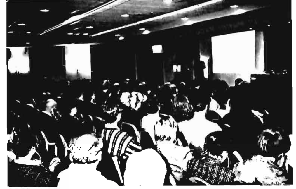
Radio and television publicity in Warsaw, Poland publicizing Rotary's free, public seminar on Free Enterprise given by a Rotary Information Team from Houston attracted so many people that over 100 had to be turned away. More than 300 citizens participated, with simultaneous translation, and individual workshops on the second day.