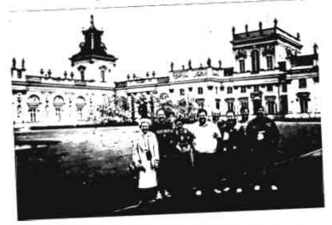
Houston's Project Free Enterprise seminar team assembles for a picture in front of Wilanov, a Royal Estate of Polish kings in Warsaw.