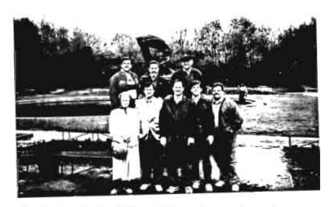
Houston's Project Free Enterprise seminar team assembles for a picture in front of Chopin's statue in a Warsaw park.