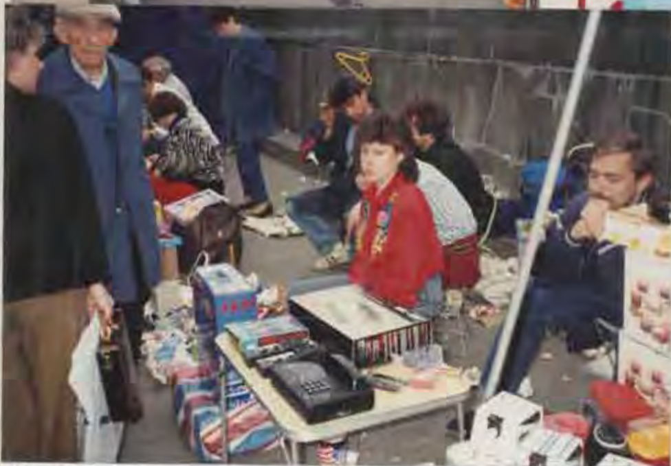
The Russians are on the bottom in Poland. Menial work, Flea marketeers, and criminal. Some Rotarians from U.S. were maced and their luggage stolen at the train station - by Russians.