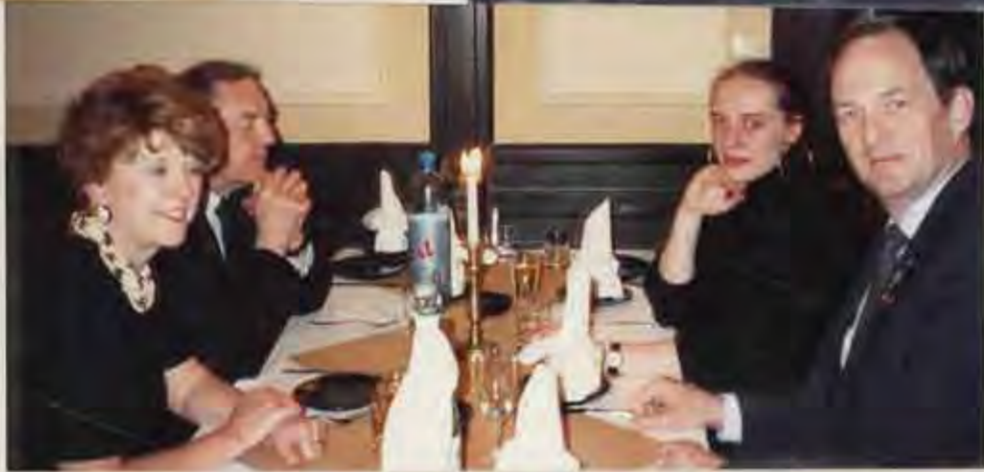
The Opera and dinner. Kabob + Rice