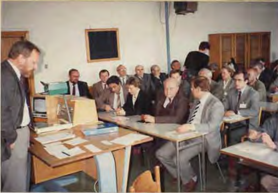
On the 2nd Day of the Seminar the speakers had small individual workshops where much of the really useful information was given