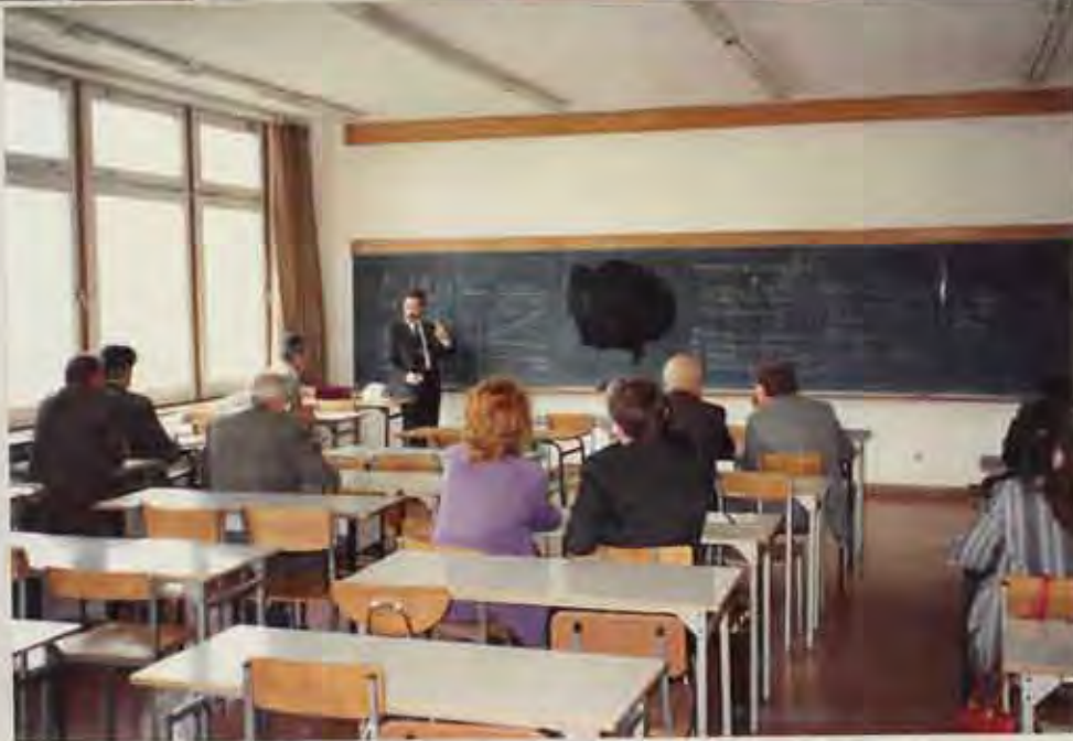
Individual workshops on each topic