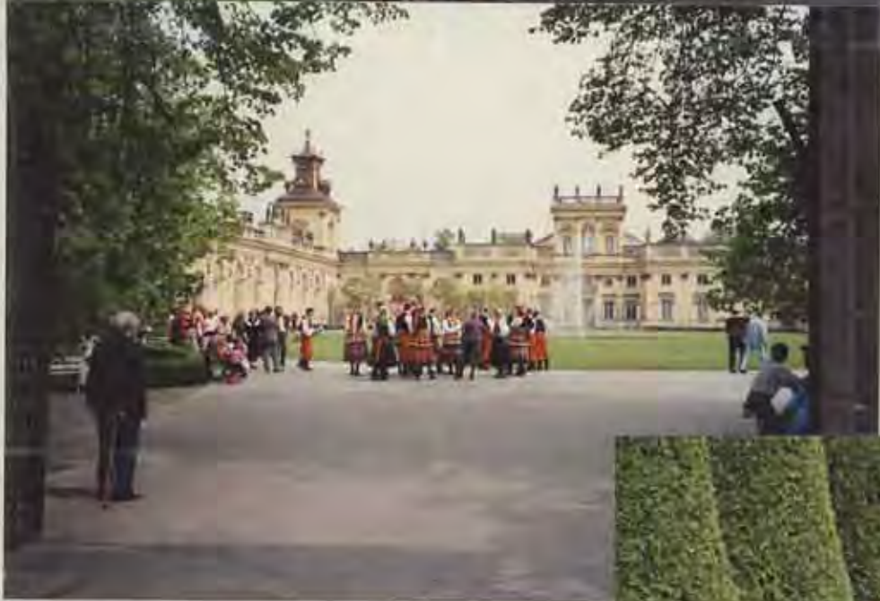
Folk Dancers on grounds of Wilanów, or in Latin - Villa Nova - a King's estate.