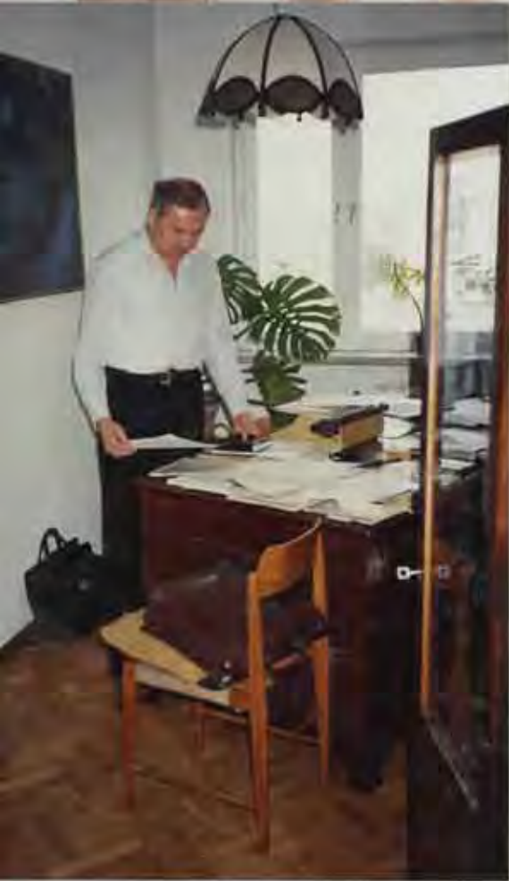
Office at home