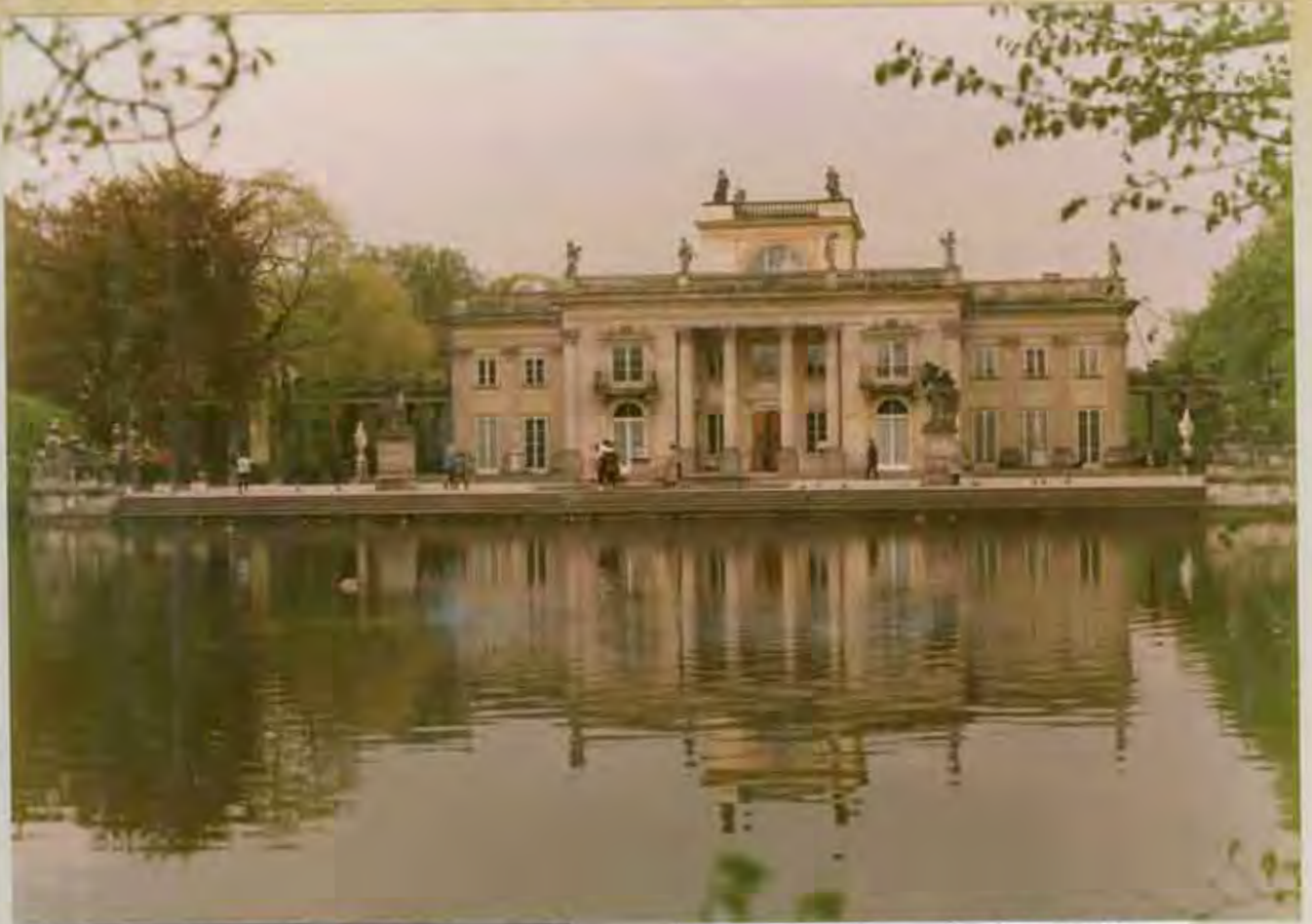
Summer palace of Polish Kings