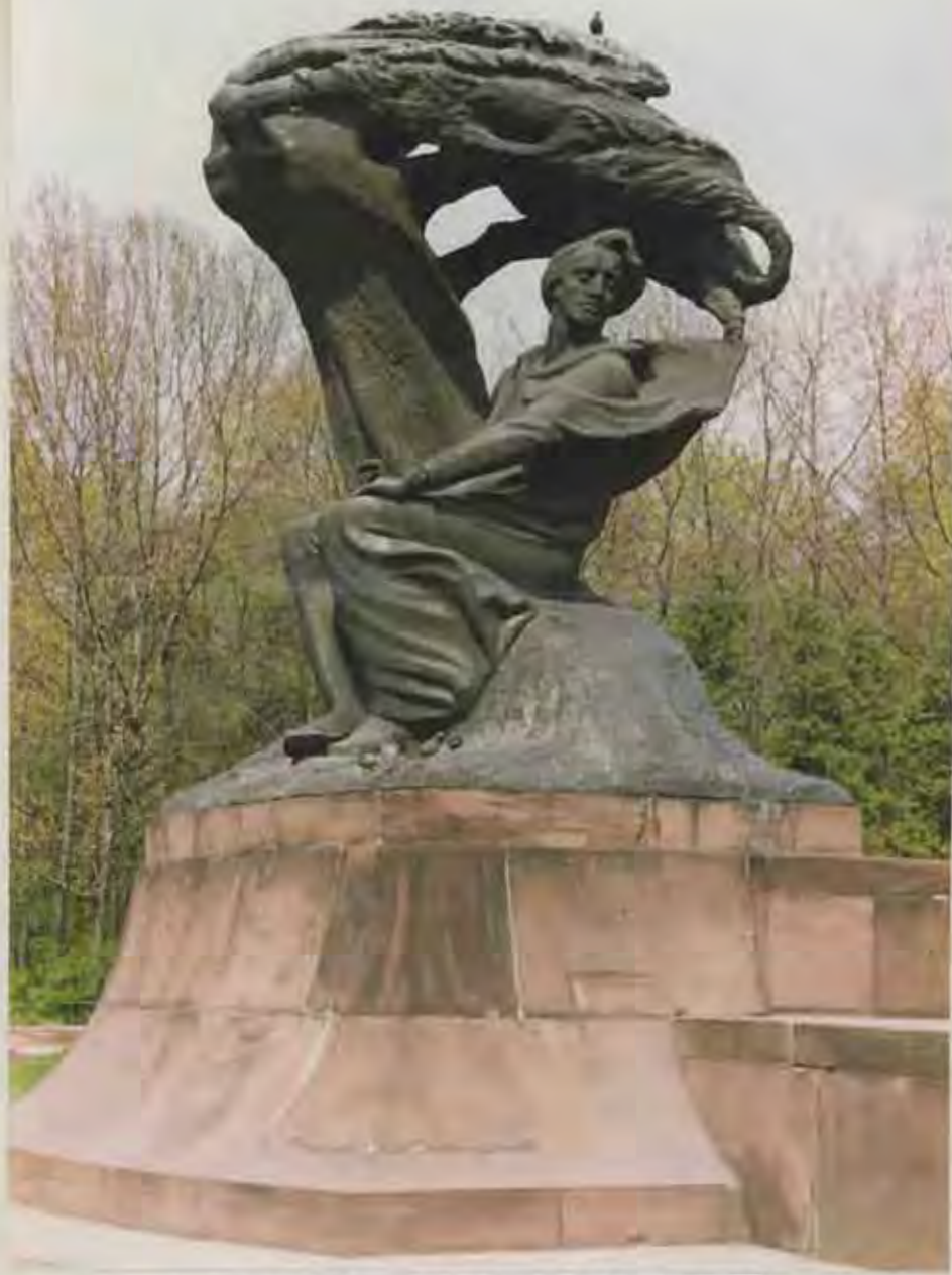
A statue of Chopin the composer