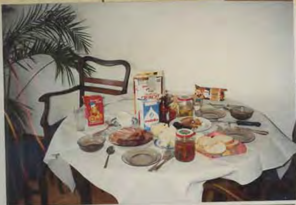
This breakfast had meats, salmon, eel, radishes, cheeses, pickled items lettuce, bread etc. They don't eat lunch.