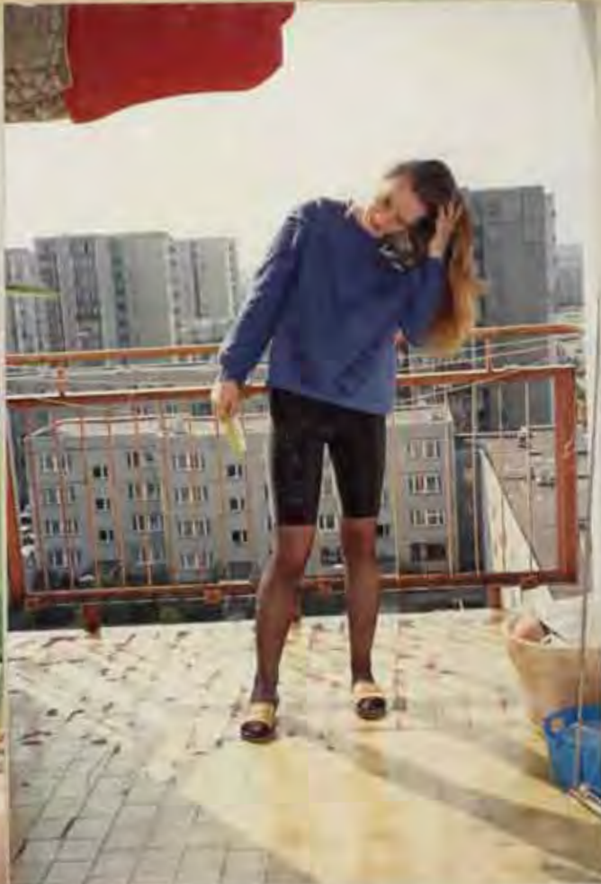
The sofa is a double bed. Hair drying on balcony.