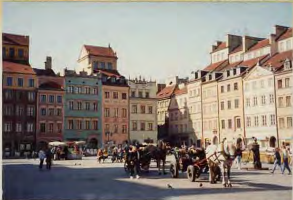
Fortunately there were accurate paintings and photos left