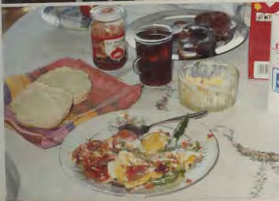
They liked the Mexican salsa and made some eggs and peppers to put it on.