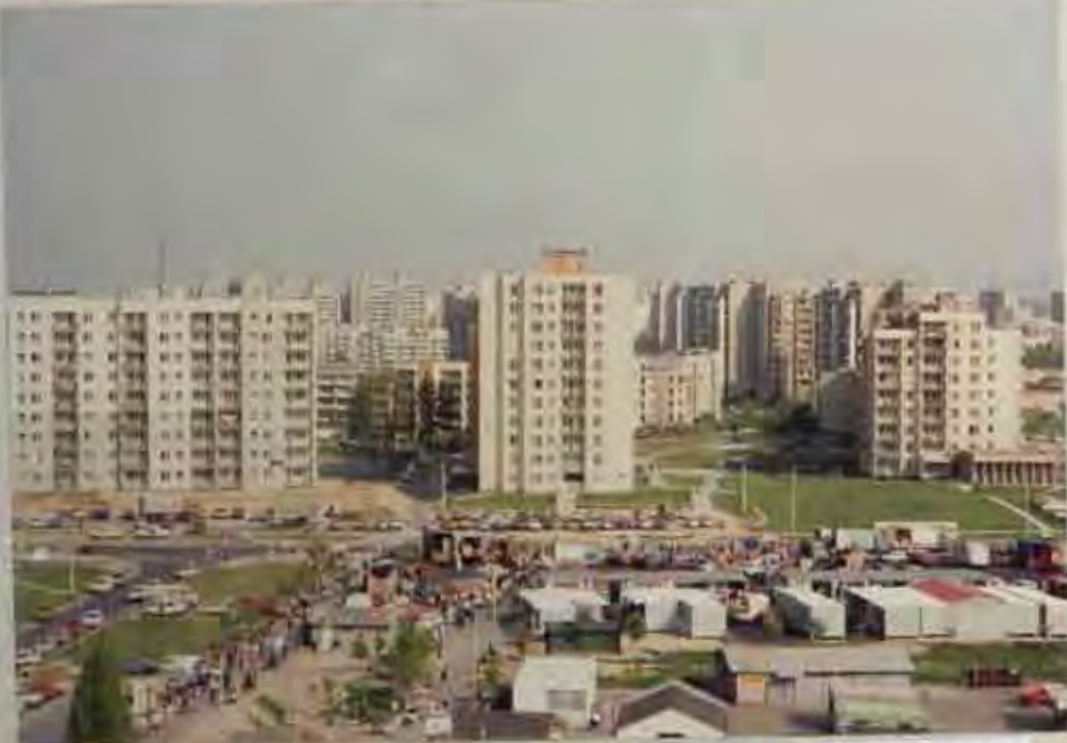
View from best flat of a Sunday market forming up.