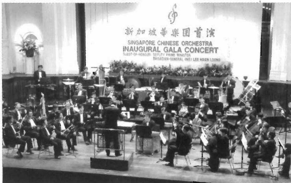
The Singapore Chinese Orchestra