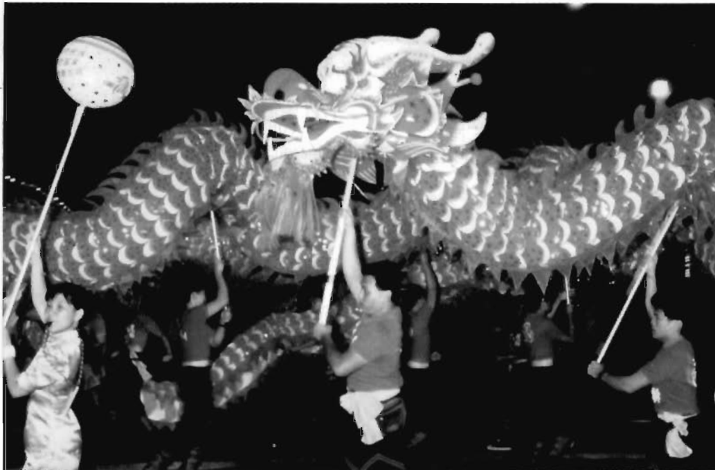
A "fire-breathing" dragon, a mainstay of Singapore celebrations, will be featured in opening entertainment.